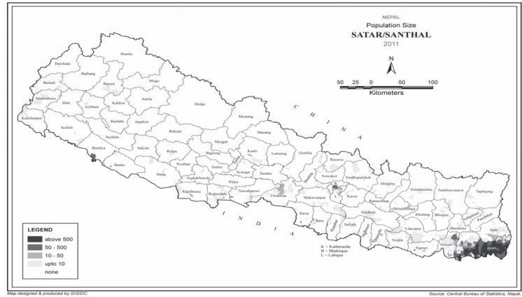
Map Showing the Santhal Population Concentration in Jhapa and Morang Districts

(Map adopted from Gurng and Tamang 2014)